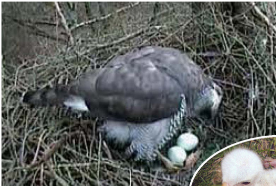
Goshawk looking after its eggs