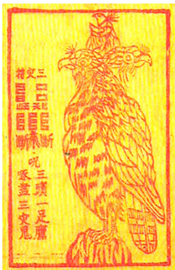
Good-luck charm portraying goshawk

Hawks were caught by similar methods throughout the history.