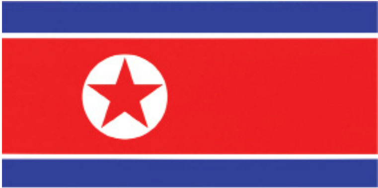
National flag of the DPRK

them represent the national will along with the identity or geographical features of the nations concerned.