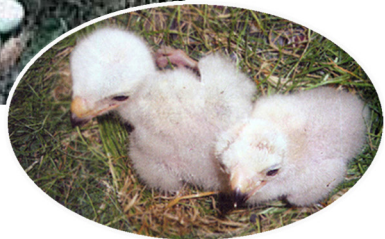
Just hatched goshawks