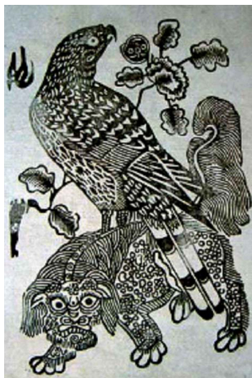
Painting portraying a goshawk