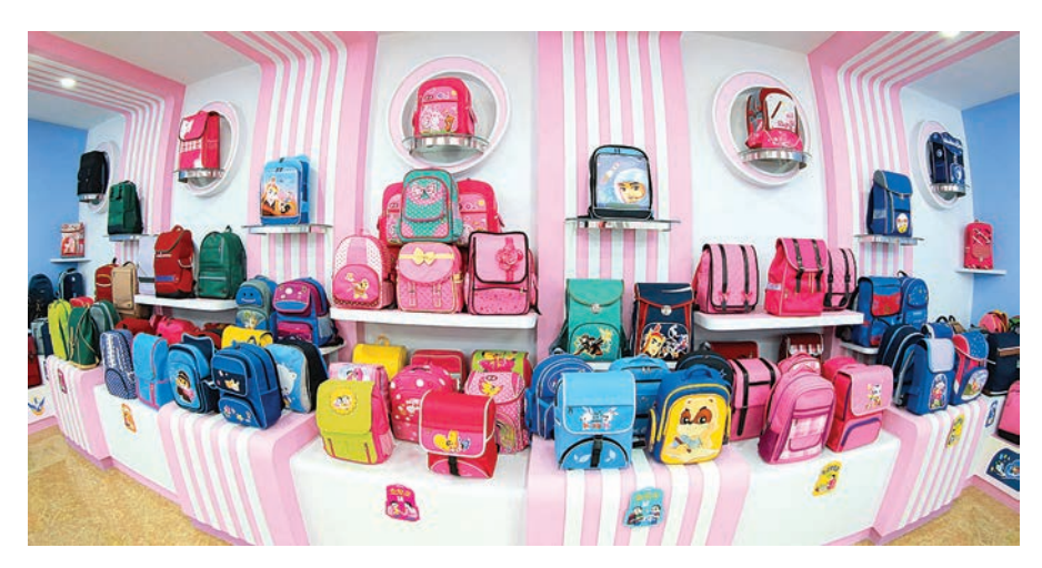
Exhibition room of the Pyongyang Bag Factory

In January 2017 the Pyongyang Bag Factory was built on Thongil Street, Pyongyang, and started operation.