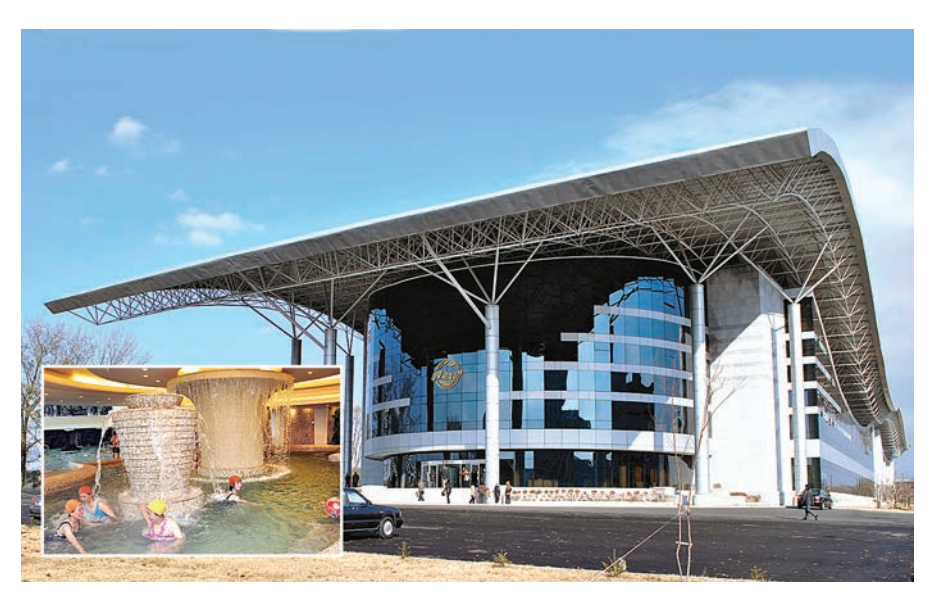
Ryugyong Health Complex