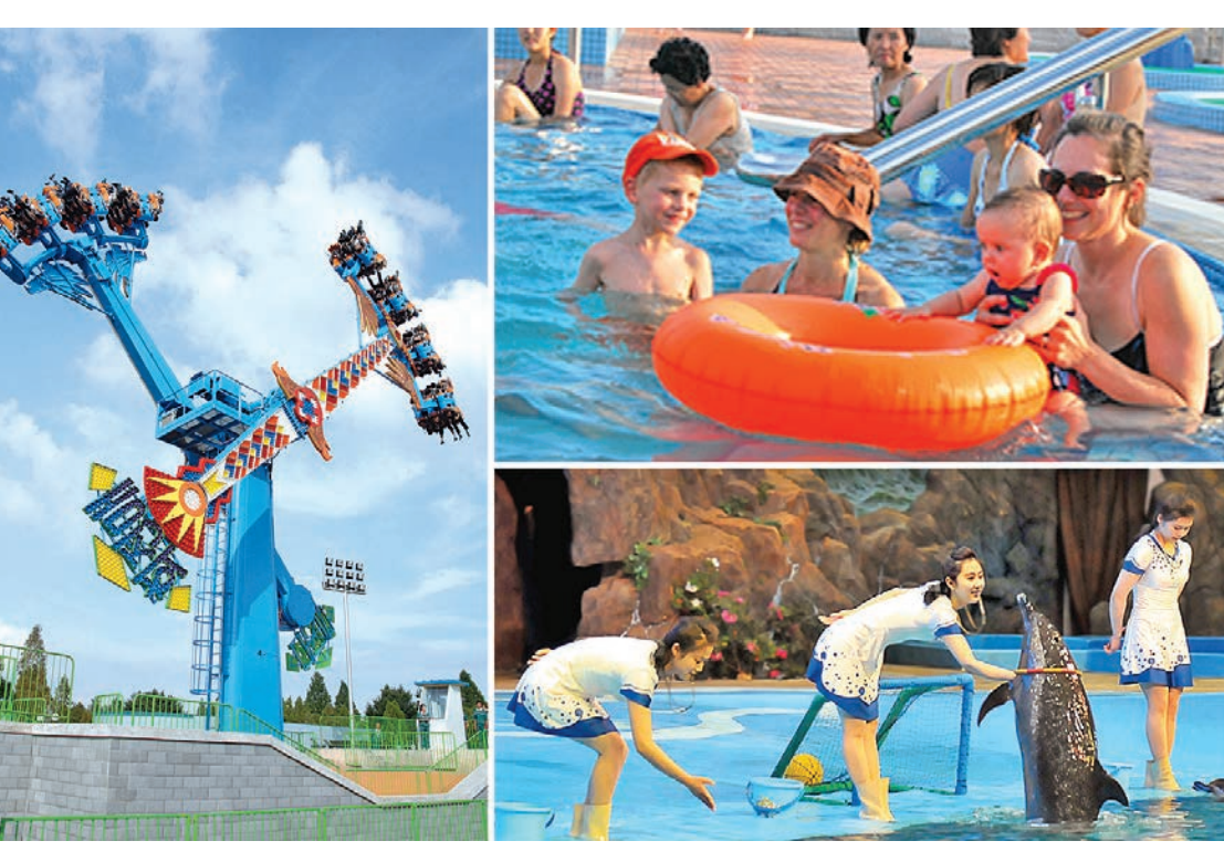
Rungna People's Recreation Ground