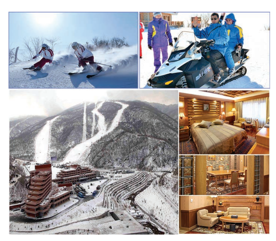
Masikryong Ski Resort