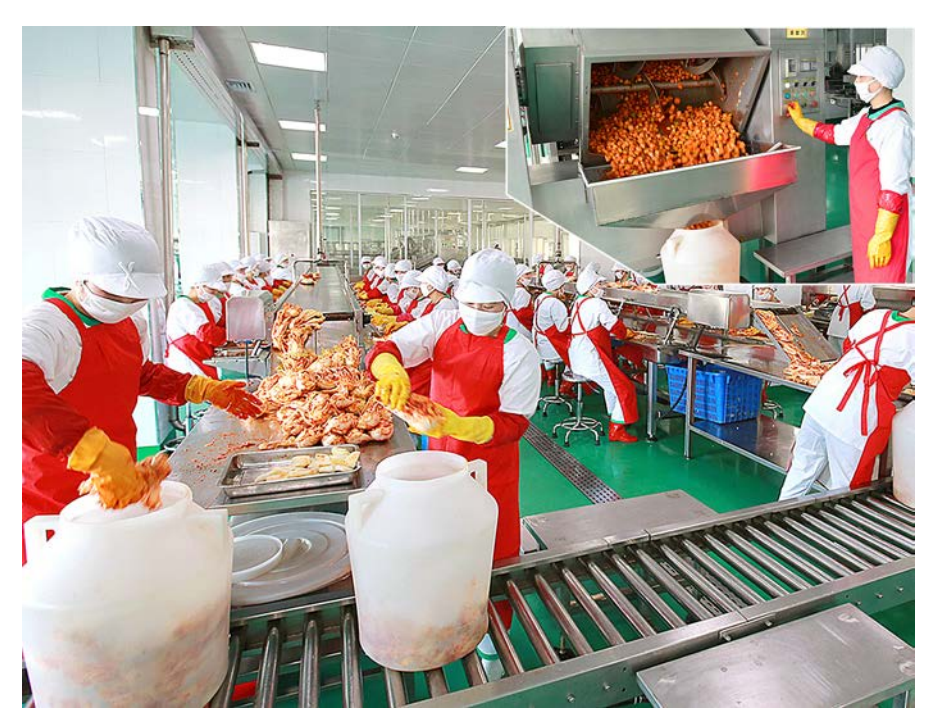
Ryugyong Kimchi Factory

The equipment, automated and robot-controlled on a high level, were designed by the Korean scientists and technicians and built and installed by the factory workers. The germ-free and dust-free production lines guarantee sanitation on a high level.