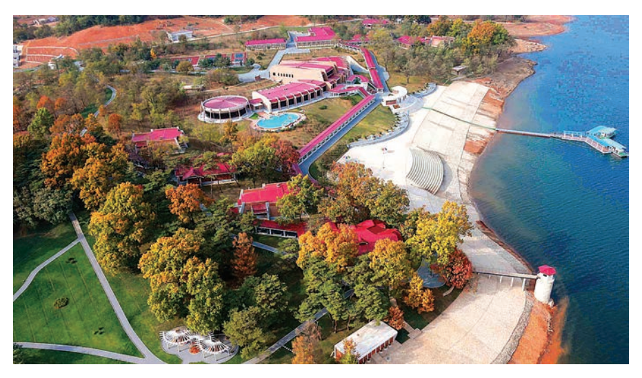
Yonphung Scientists Holiday Camp