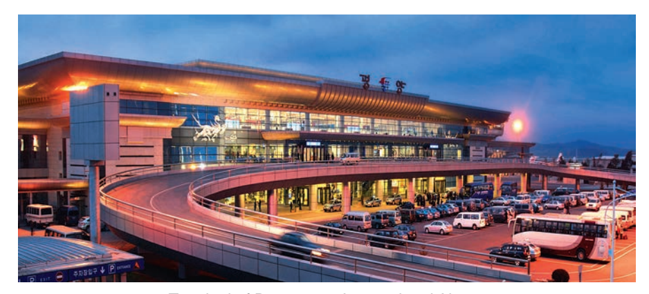
Terminal of Pyongyang International Airport