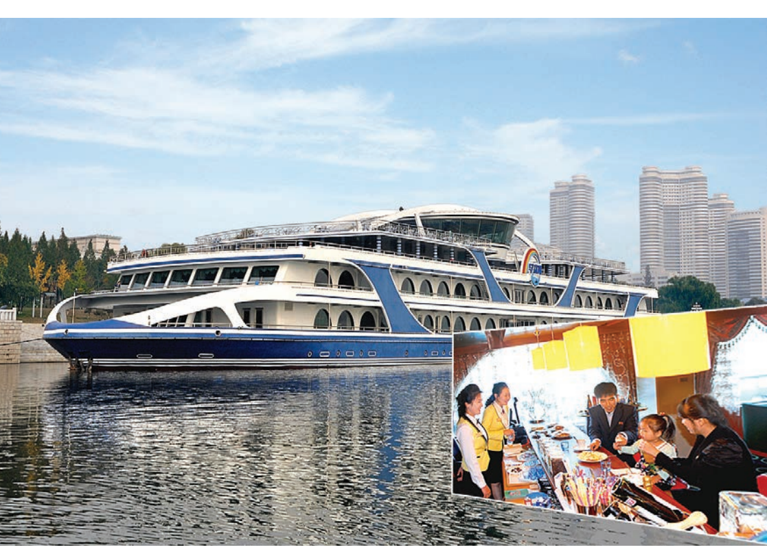
Floating restaurant Mujigae