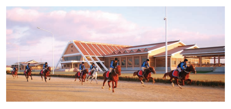
Mirim Riding Club