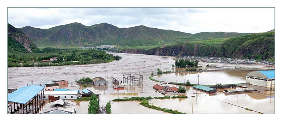
Part of the flood-stricken areas in North Hamgyong Province

Rehabilitated floodstricken areas in North Hamgyong Province