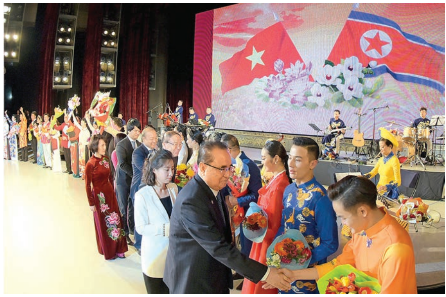
Sunshine of Spring Days given in the DPRK by a national art troupe of Vietnam (April 2019)