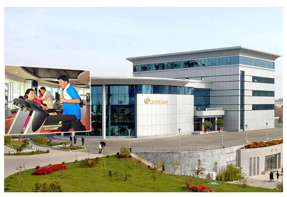
Thongilgori Fitness Centre

and Fish Shop, Rungna People's Recreation Ground, Thongilgori Fitness Centre, Ryugyong Health Complex, People's Open-Air Ice Rink, Roller Rink, Breast Tumour Institute of the Pyongyang Maternity Hospital, and renovated the Mangyongdae and Taesongsan amusement parks as required by the times.