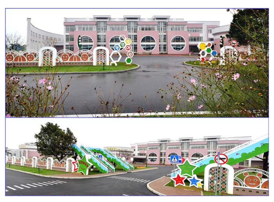
Pyongyang Baby Home and Orphanage