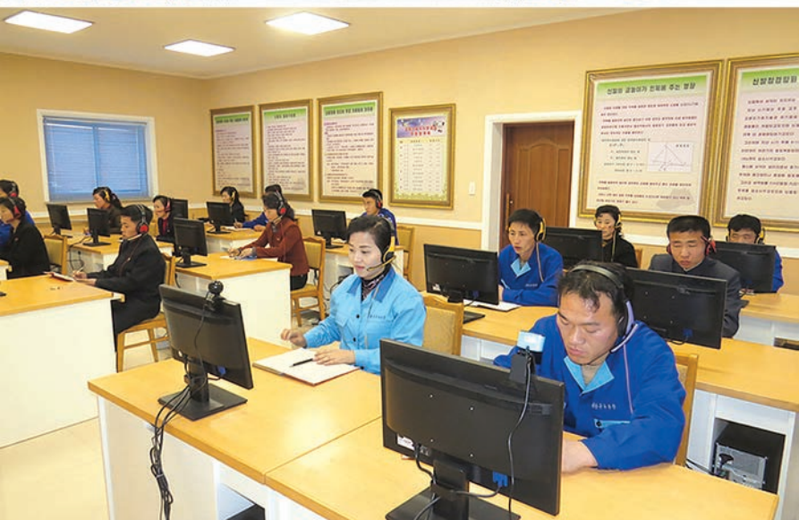
Wonsan Leather Shoes Factory

highest level can the quantity and quality of leather shoes be improved decisively.