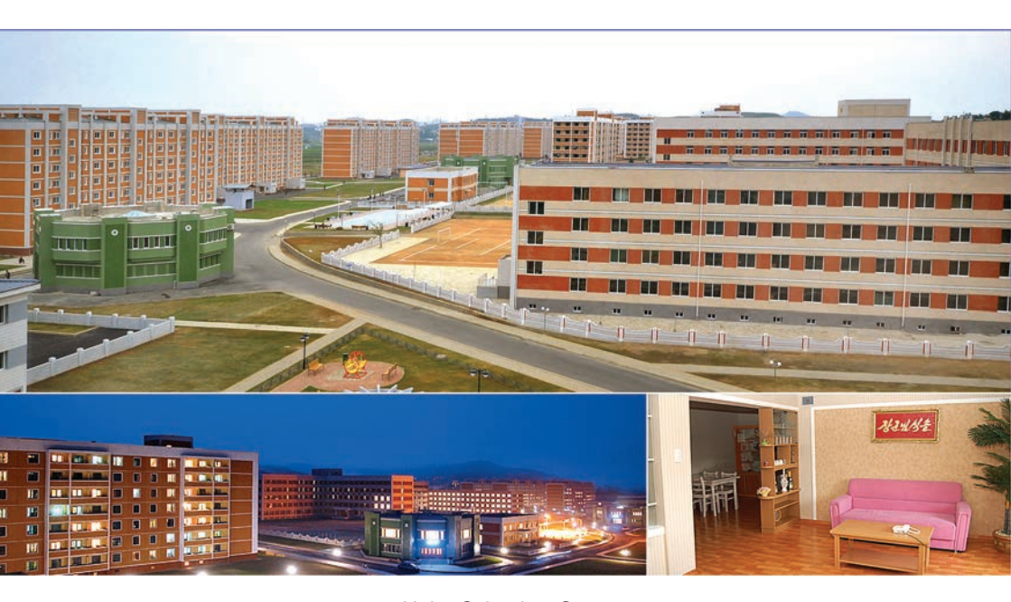
Unha Scientists Street