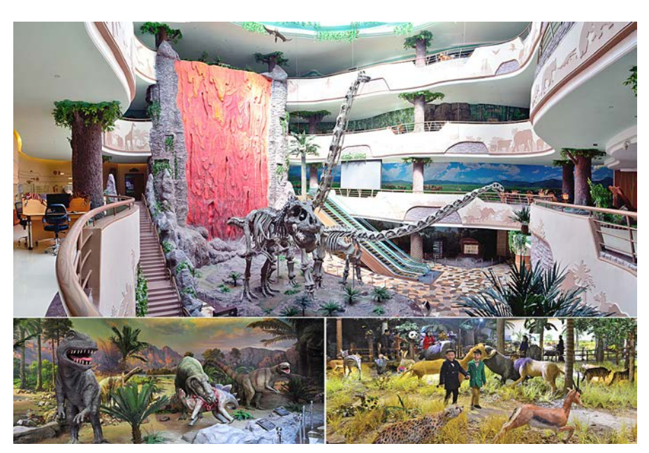
Interior of the Natural History Museum

In 2016 the Central Zoo was renovated and the Natural History Museum built for the people's cultural and emotional life, and the bases conducive to the promotion of people's health, including the Medical Oxygen Factory and Ryugyong General Ophthalmic Hospital, and monumental structures of the times, including Unit 3 of the Paektusan Hero Youth Power Station, were built. Moreover, many light-industry factories for the improvement of the people's livelihood such as the Ryongaksan Soap Factory, Mindulle Notebook Factory, Pyongyang Cornstarch Factory and Pyongyang Terrapin Farm and Mangyongdae Children's Camp were built or renovated.