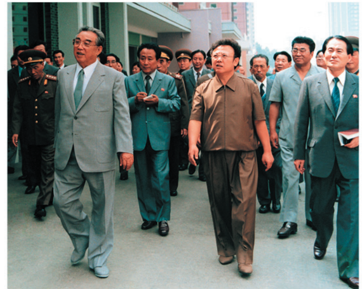
Kim Il Sung and Kim Jong Il look round houses (August 1985)