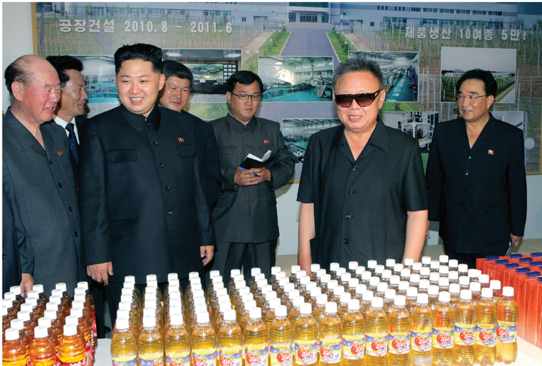
Kim Jong Il and Kim Jong Un give field guidance at the Taedonggang General Fruit Processing Factory (July 2011)