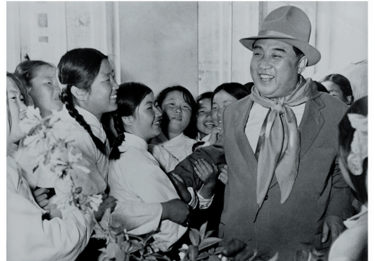
Kim Il Sung with students of a school for bereaved children (May 1961)