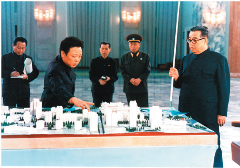
Kim Il Sung and Kim Jong Il examine the relief map of a street (April 1980)