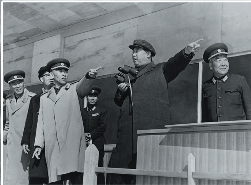
Kim Il Sung gives guidance to a joint military exercise of the KPA combined units (October 1970)