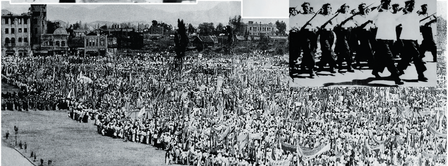
Kim Il Sung acknowledges enthusiastic cheers of the heroic service personnel and people