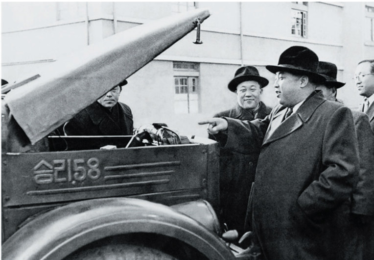
Kim Il Sung examines the first Sungni-58 truck (November 1958)