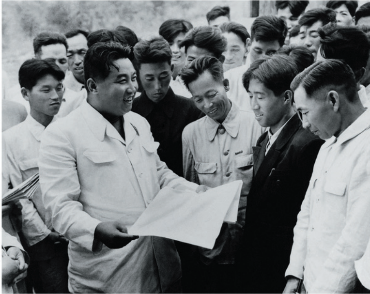
Kim Il Sung meets workers (September 1959)