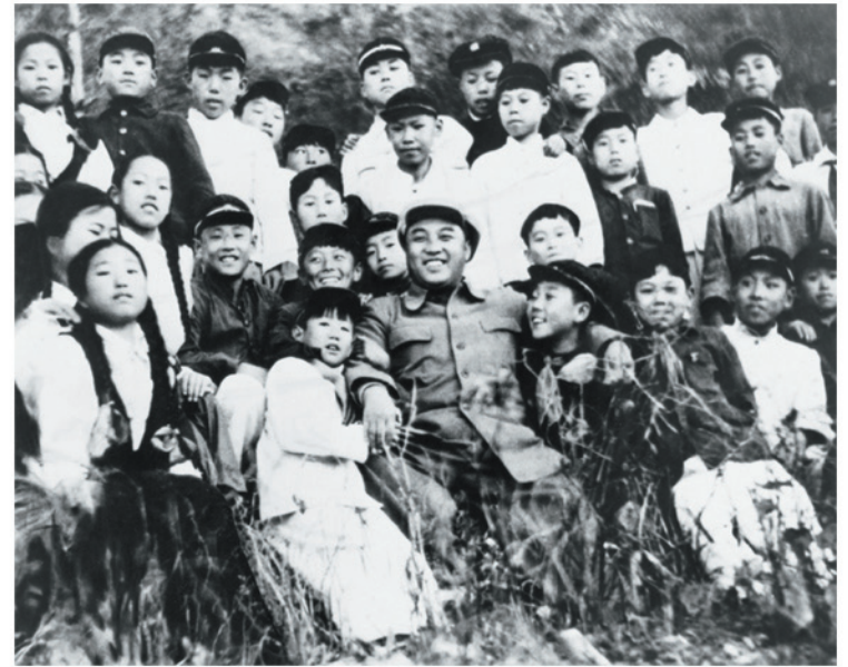
Kim Il Sung with secondary school students (October 1957)