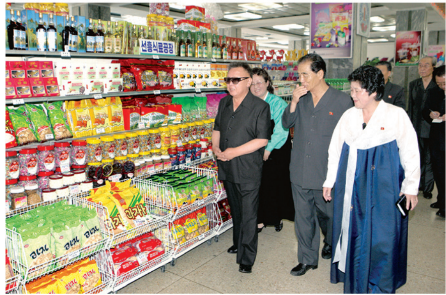
Kim Jong Il looks round a goods show (July 2011)