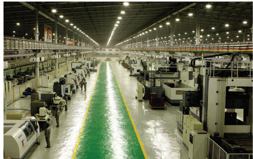
Huichon Ryonha General Machine Factory