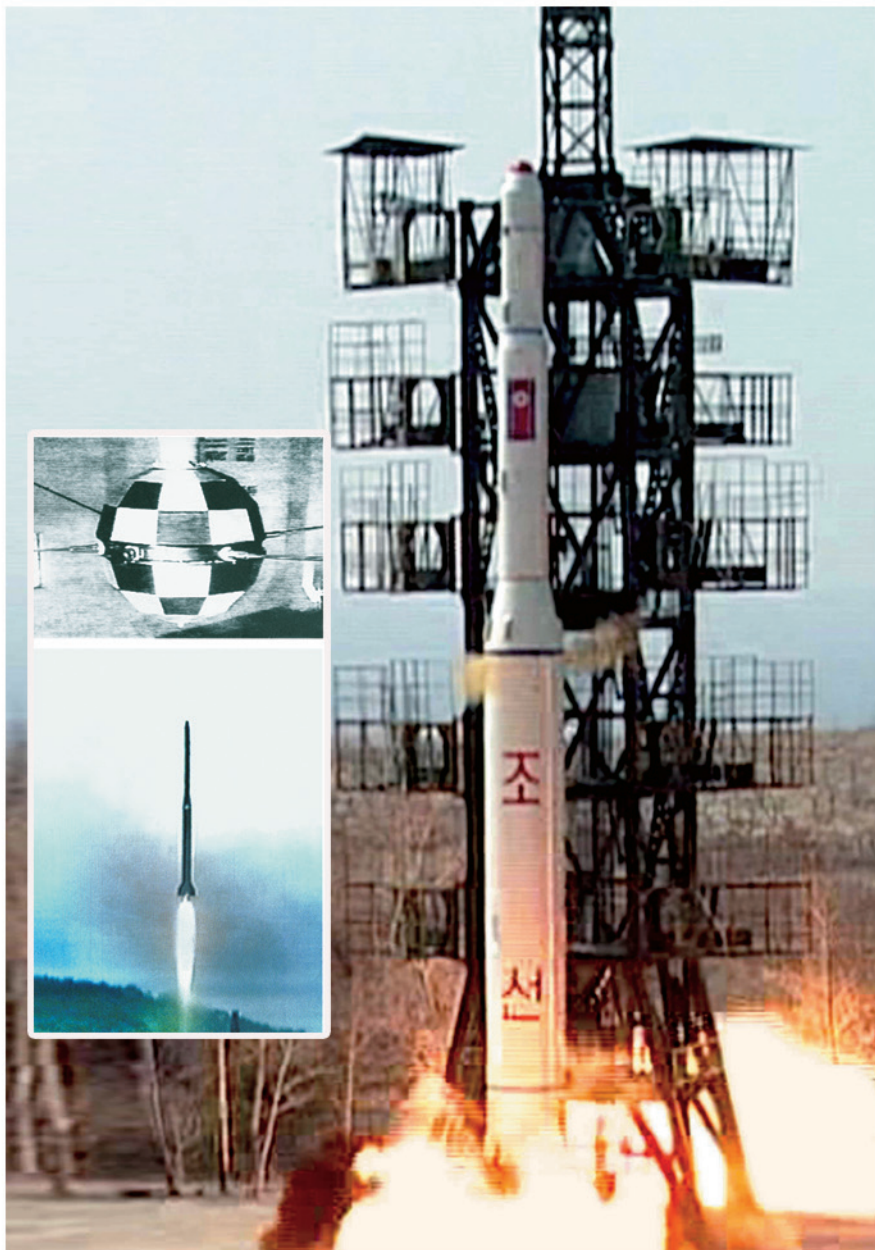
Launching of the artificial earth satellites Kwangmyongsong 1 and 2