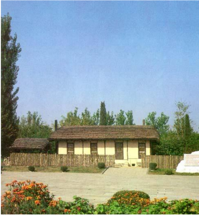
Kim Jong Suk's native home in Hoeryong