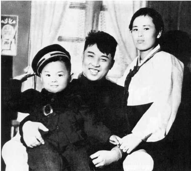
Kim Jong Suk with Kim Il Sung and their son Kim Jong Il