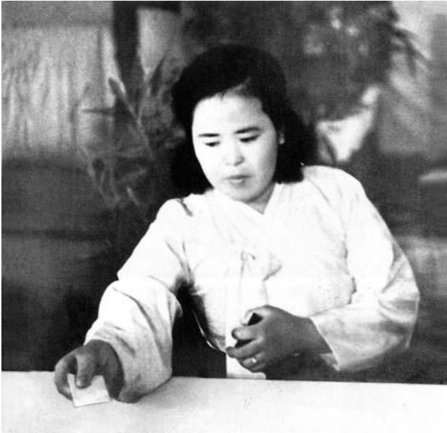
Kim Jong Suk casting a ballot at a people's power organ election

Kim Jong Suk attending the graduation ceremony of the second term of the Central Military Academy No. 1 with Kim Il Sung and Kim Jong Il