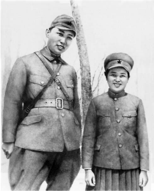
Kim Jong Suk posing with Kim Il Sung in the days of the anti-Japanese armed struggle